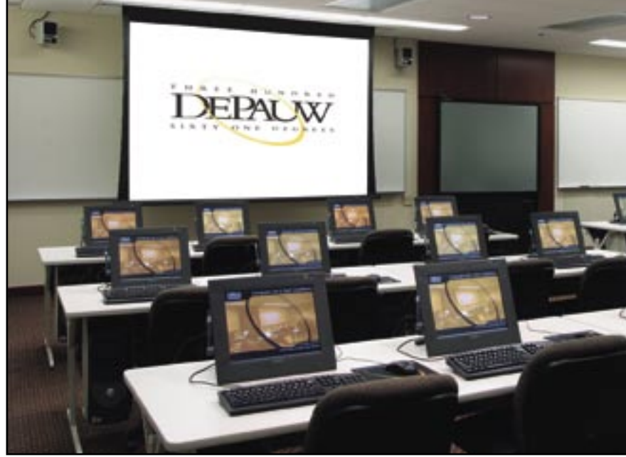
Julian Collaboratory, Julian Science and Mathematics Center, DePauw Univ., Greencastle, IN.